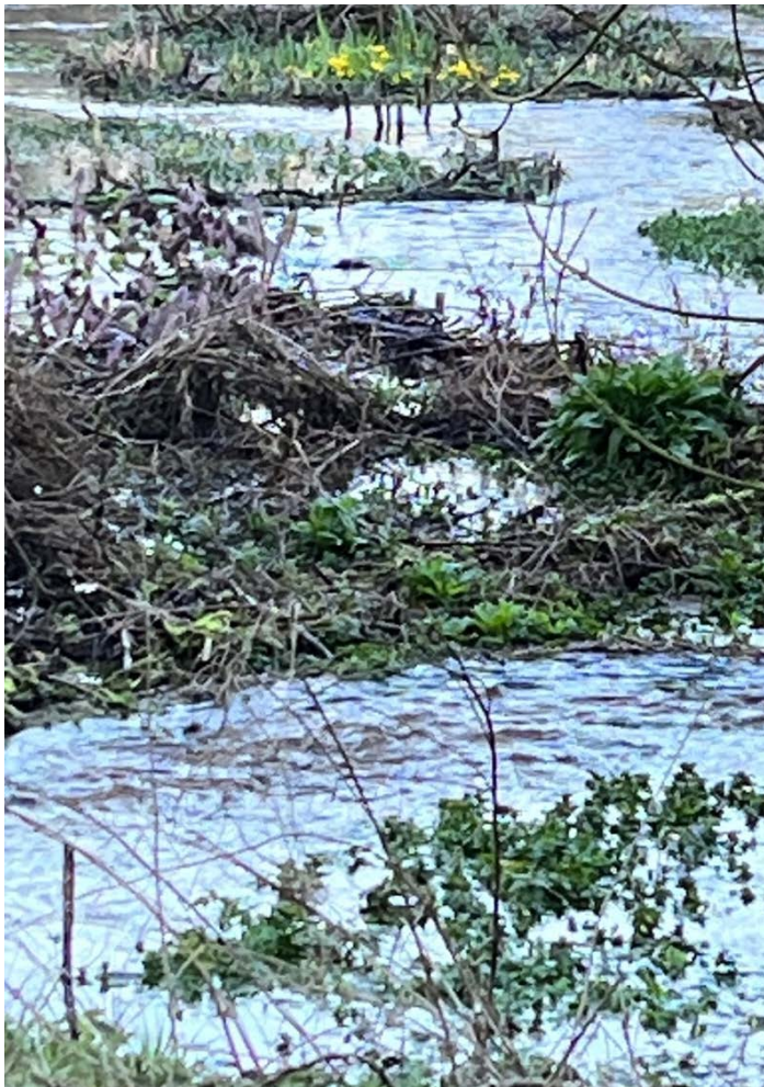
The Chalk stream in full flow February 2024