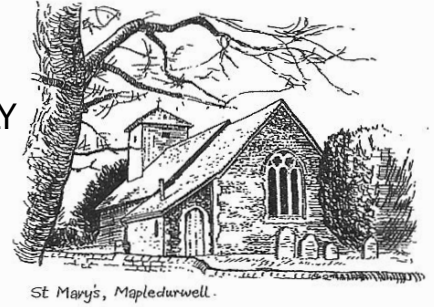
St Mary's, Mapledurwell.

St Mary's Mapledurwell 10 March, 10am ALL WELCOME