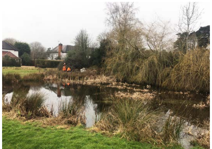
Newnham Green main pond February 2024

www.hants.gov.uk/landplanningandenvironment/nature-recovery-hampshire/hampshire-strategy