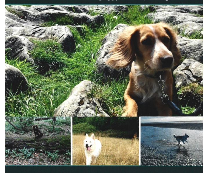
Fun, positive and reward based dog training. Puppy, adult and 1-1 sessions for groups or individuals. Intensity course available too! Check out our website or contact us for more details of what's on offer.

Book online now! New puppy classes starting soon.