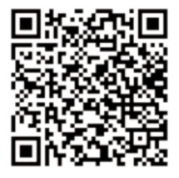
Please see the poster on the back page for this year's Summer Camp

God Bless and see you next time! Helen C