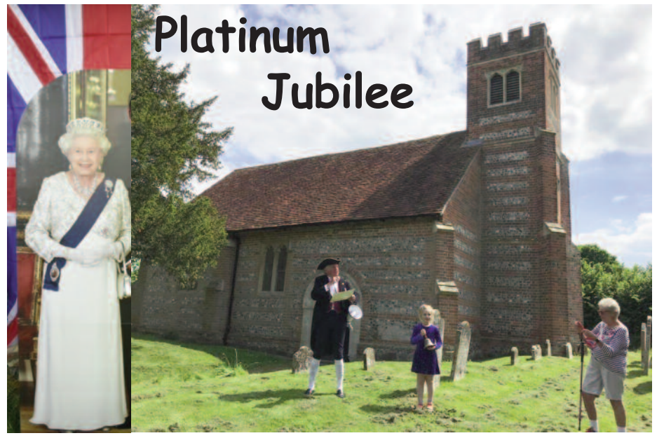
Jubilee celebrations in Up Nately started with our Town Crier outside St Stephen's, and continued later in the playing field where a big crowd of residents gathered from both Up Nately and Mapledurwell. There were lots of games, drinks, and how lovely to meet up again with people we had not seen since lockdown! It was a super celebration, huge thanks to the organisers!