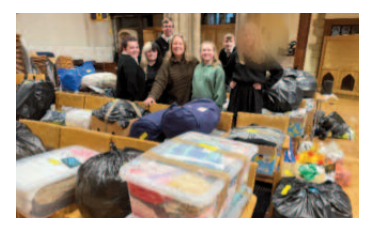
* Refugees are people who have had to leave their homes because it isn't safe to stay there any more.