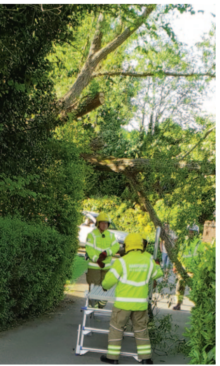
'The tree was blocking the entrance so I called the Fire Brigade. They came very quickly and were very cheerful. Bit of excitement on dull Saturday on Lockdown!'

Water End planters – evidencing the care and attention they receive