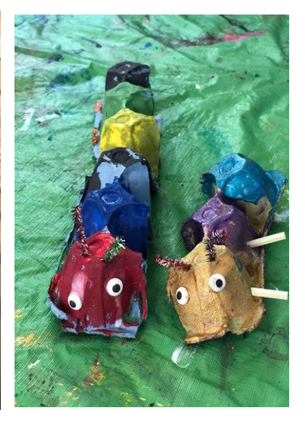
The youth have been gathering every day for Fun@4 – a different Zoom activity each day. We've learnt to sketch animals, say The Lord's prayer in sign language and even cook for our families!