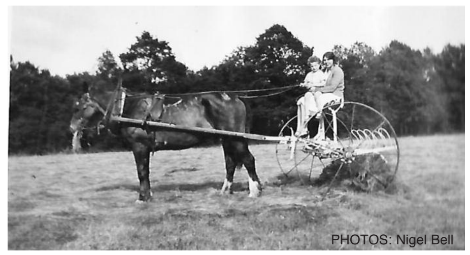
Hay raking June 1929, Manor Farm, Nately Scures

The community newsletter for Mapledurwell Up Nately, Nately Scures and Newnham