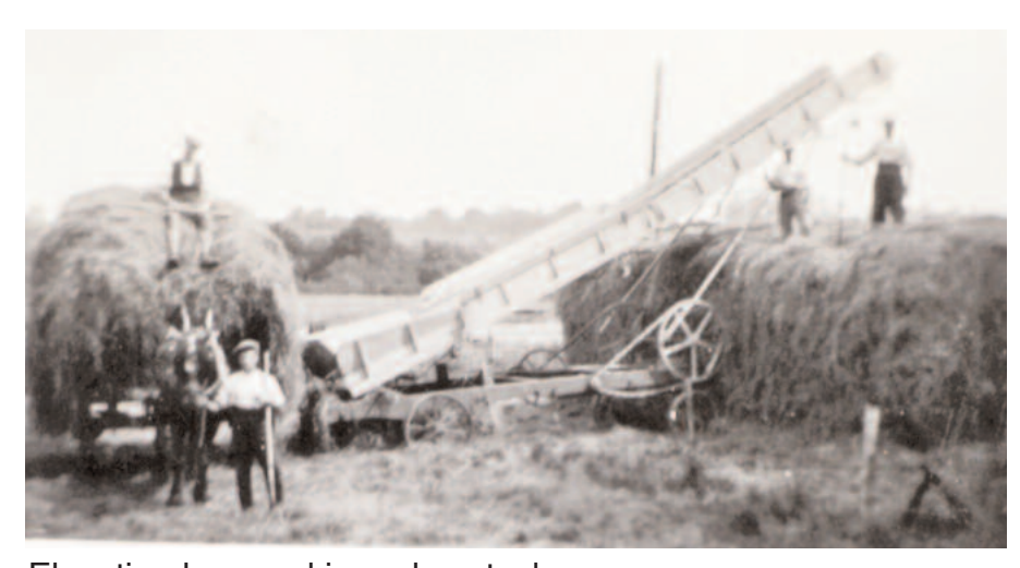
Elevating hay, making a haystack