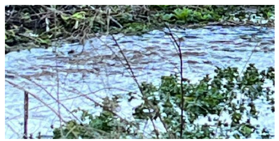
See overleaf for Parish planning applcations