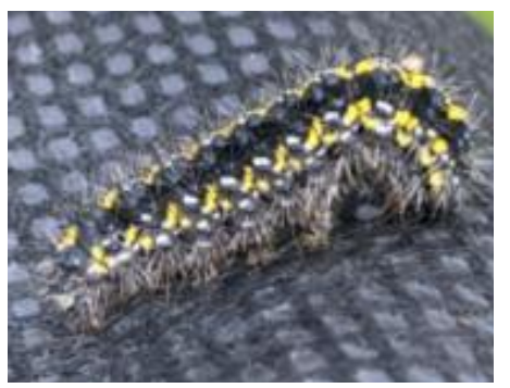
Scarlet tiger moth caterpillar